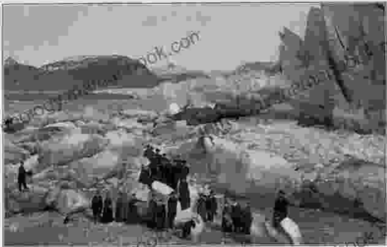
THE MUIR GLACIER IN THE SEVENTIES, SHOWING ICE CLIFFS AND STRANDED ICEBERG

Alaska's glaciers held a profound fascination for Muir, who marveled at their colossal size and transformative beauty. He eloquently described their icy rivers as "frozen nature," their slow but relentless movement shaping the landscape with each passing year. In Glacier Bay, he witnessed the thunderous calving of glaciers into the sea, an unforgettable spectacle that left him awestruck and humbled.